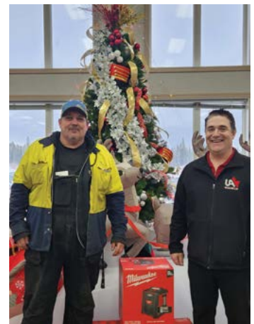
continued on next page >>